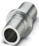
Aluminum adapter, to fix the P-PEN during plotter marking